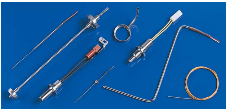
sensors, temperature control